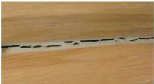
Sealant applied without a backing material to joint between unseasoned logs

What about joints that are too narrow to insert even the smallest diameter backer rod? In these situations a narrow strip of water-resistant masking tape works quite well. You don't want to use masking tape that wrinkles when it gets wet since the wrinkles may show through the sealant. An excellent option is to use pinstripe tape, available at most automotive supply stores. The tape is vinyl, so it's waterproof and our sealants won't adhere to it. Pinstripe tape is available in widths down to 1/8".