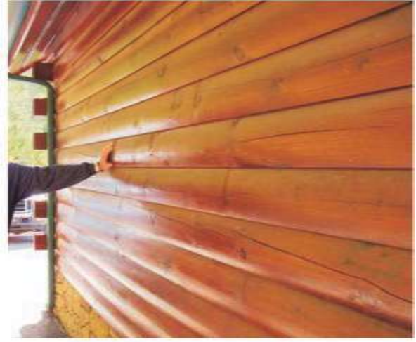
One of the first homes topcoated with Advance Gloss. On the left is the initial coat. On the right is the same wall, no maintenance, almost 7 years later