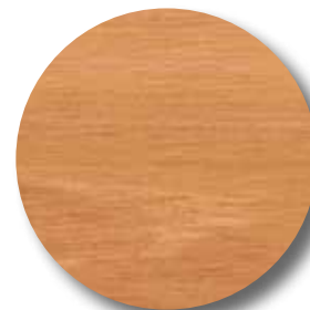
005 Natural Oak