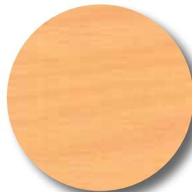
996 Natural Light

Note: Printed colors shown here may vary from actual product colors.