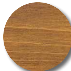
009 Dark Oak